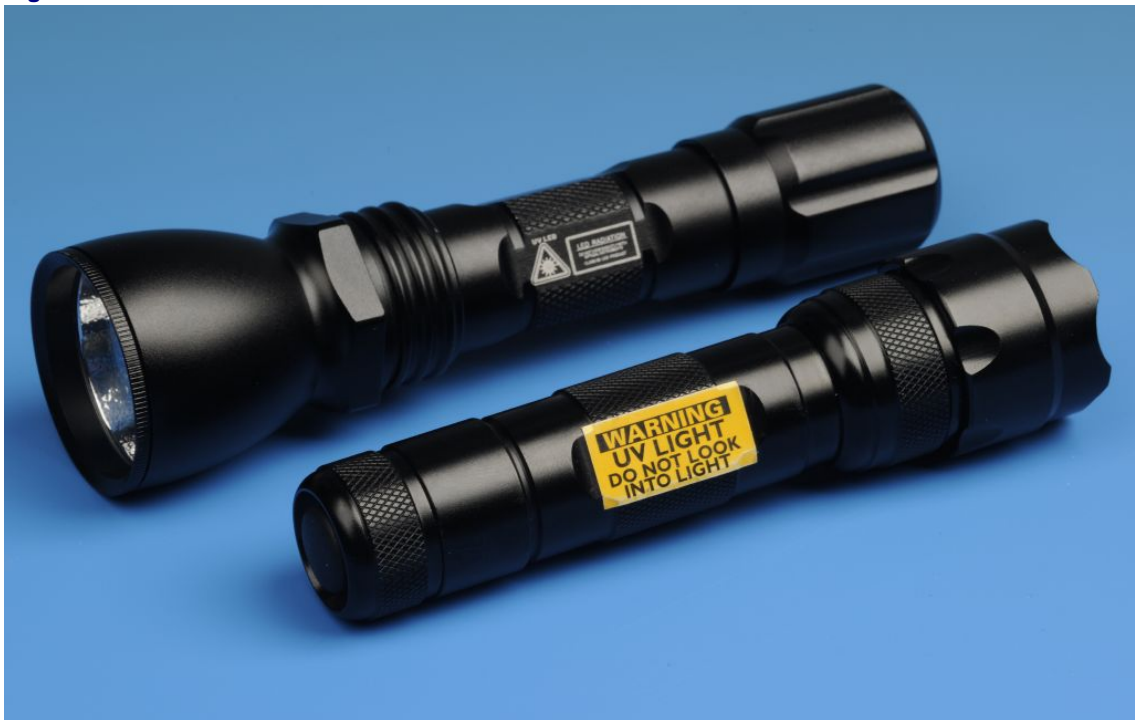
Figure 1 General view of torches

Ultraviolet radiation (UVR) emissions from two UV torches incorporating light emitting diodes (LEDs) have been measured in order to identify potential optical radiation hazards to persons exposed to the beam from the torches. Each torch incorporates a single LED and rear reflector protected by a transparent front cover (see figures 1-3). Each torch contains a different LED with a different peak wavelength. Torch A has a peak wavelength of 365 nm and torch B 390 nm.